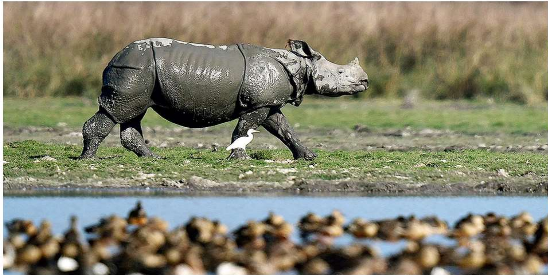
Representational file image of a one horned Rhino.

January 07, 2024 01:36 am | Updated 07:46 am IST - GUWAHATI